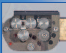
Polyfil Compact drive mechanism with wire straightening system